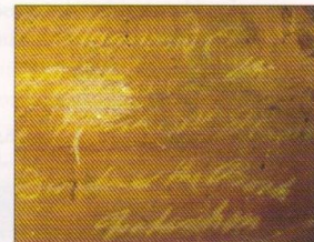
Fig 4 Chalk inscription under one of the Plowman chairs

inherited the house in 1824 and made extensive changes.