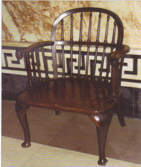
Fig 1 A Holkham Hall mahogany windsor

The history of Westacre High House is well documented in The Birkbecks of Norfolk by H. Birkbeck. 3 It was built in 1756. Anthony Hamond (1805-1869)