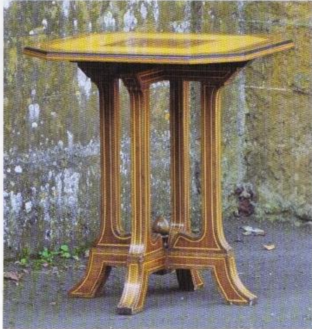
Fig. 5 Occasional table, Jackson & Graham after a design by Owen Jones, 1872.

Just six other pieces from this commission are known today and they are all in the Victoria & Albert Museum. They were acquired by the museum in the 1950s when Eynsham Hall was a police college. The table is depicted in Jones's watercolour designs for the interiors of Eynsham Hall (Fig. 6). It is visible alongside the chairs now in the V&A. The designs were donated to Reading University's Library Archive by descendants of the Mason family.